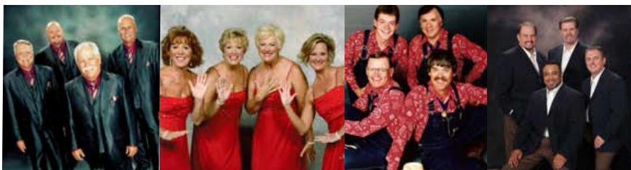
The King's Heralds

Watch for the Heralds on WFLA News Channel 8 Early Morning Show on November 28th!