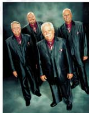
A Quartet of Champions Flashback